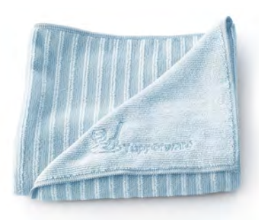
Recycled Microfiber Mop Towel Soft side traps dust and textured side scrubs. 81951 $19